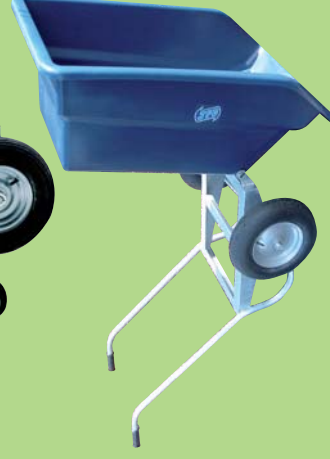
TWB5 – New JFC Tipping Wheelbarrow